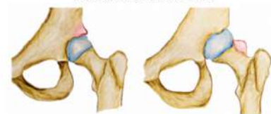
Pincer Impingement Cam Impingement

Untreated hip impingement can cause hip damage and is thought to be a risk factor for the development of osteoarthritis.