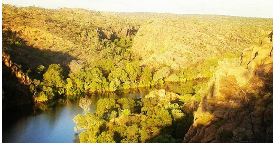
NITMILUK GORGE - NORTHERN TERRITORY