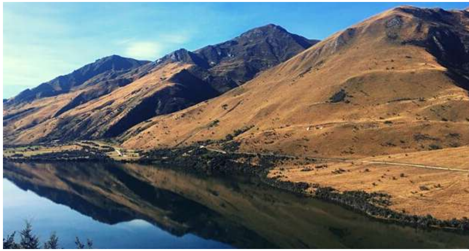
MOKE LAKE - NEW ZEALAND