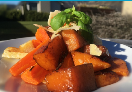
Garnish with Parmesan and basil